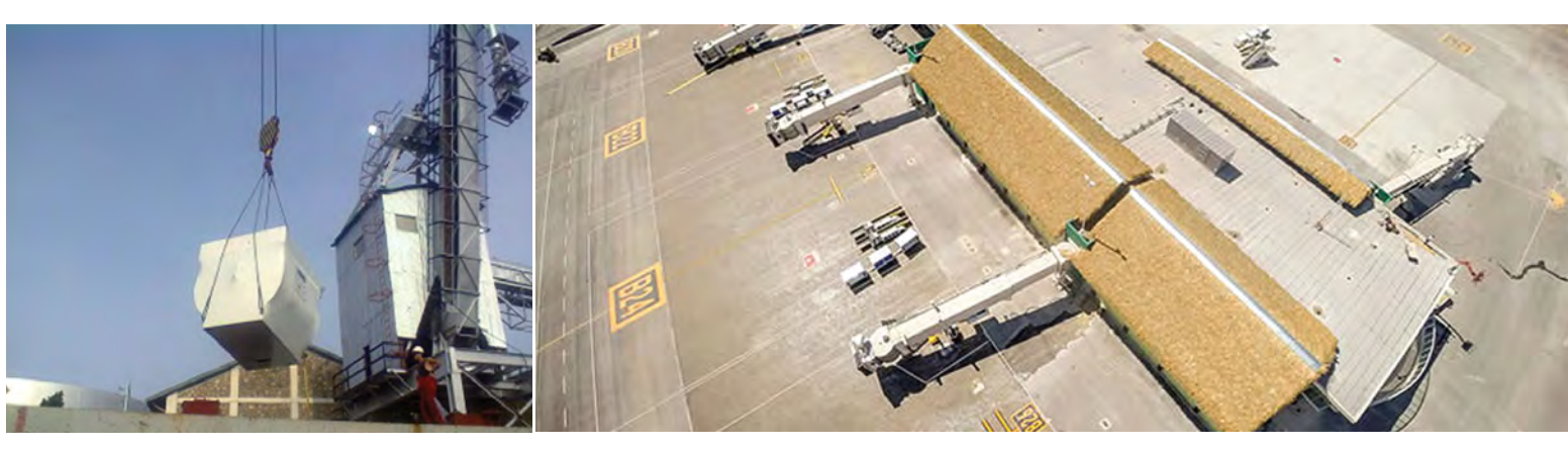
Punta Cana airport expansion project:

Descarga de generadores. Puerto: Caucedo.