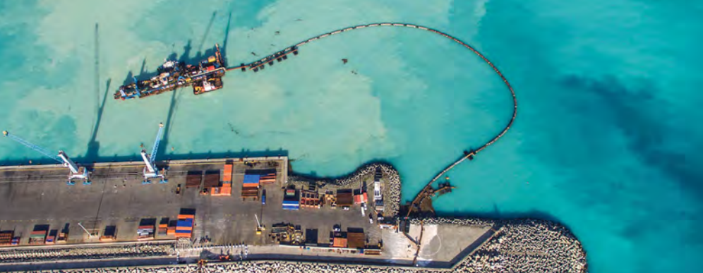
Caucedo port dredging project. Haina Port dredging project