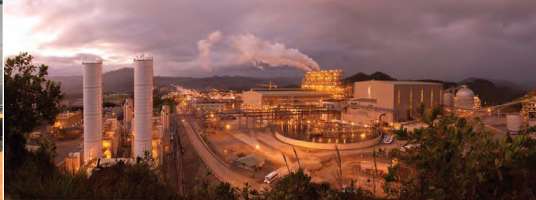
Barrick Gold Mine Construction Project:

Port and land logistics during construction. Ports: Río Haina and Puerto Plata.