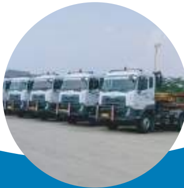
WORKSHOP AND OPEN YARD IN JABABEKA INDUSTRIAL ESTATE TOTAL AREA OF 20.000 SQM