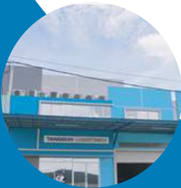
OFFICE AND WAREHOUSE IN NORTH JAKARTA