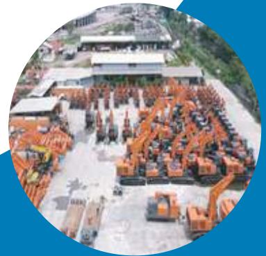
TEMPORARY STORAGE IN NORTH JAKARTA, TOTAL AREA 8.000 SQM