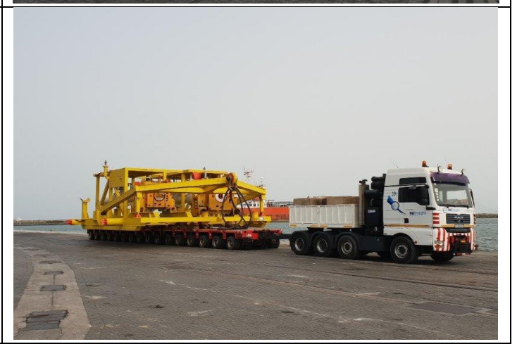
OOG Cargo transported for GE – Takoradi