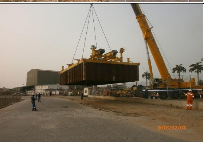
OOG Cargo transported for METKA / Amandi / GE Project in Aboadze.