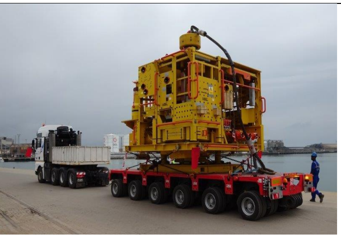
OOG Cargo transported for EMAS – Takoradi