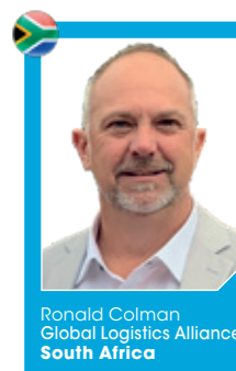
Ronald Colman Global Logistics Alliance South Africa